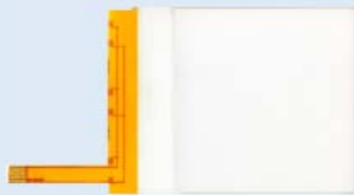
1.54 inch Front Light